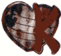
One World-One Heart