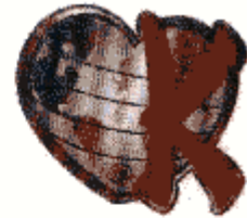
One District-One Heart

The Lions International theme for 2002-03 is "ONE WORLD-ONE HEART", we can strengthen that theme by making it " ONE DISTRICT-ONE HEART ".