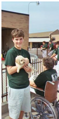
Future Lion and Future Leader Dog