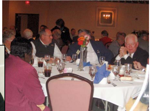
Lions enjoyed a delicious buffet meal served by the staff of the Badly House. Shown are Central Elizabeth and McKeesport Lions at this table.